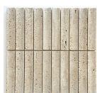
CONCAVE KIT KATS 305X318 SHEET