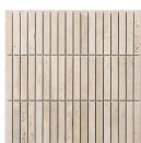
MINI KIT KATS 305X305 SHEET